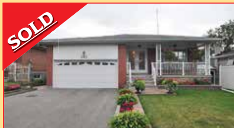
105 Pleasant View Dr. $1,250,000. Call For A Free Market Evaluation.