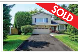
27 GLENVIEW DRIVE, AURORA