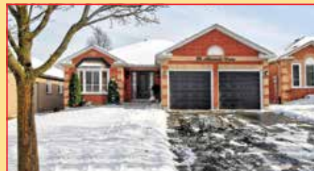
Hot Exclusive Listing! $1,499,900 South Aurora Location. Totally Renovated Bungalow, Top To Bottom With Finished Walkout Basement. Open Kitchen/Family room.