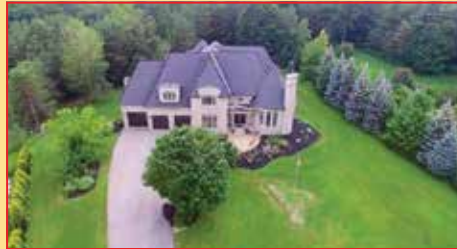
Prestigious Trail Of The Woods! 7,500 Sq Ft Of Luxury On 1.25 Acres Builders Own Home $ 2,750,000