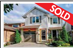
134 BATSON DRIVE, AURORA