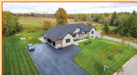
Modern Bungalow! $1,598,000 Situated On Quiet Court On Approx.13.5 Acres, Oversized Garage, Finished Walkout Basement