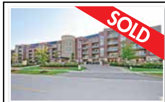
35 BAKER HILL BOULEVARD #216, STOUFFVILLE