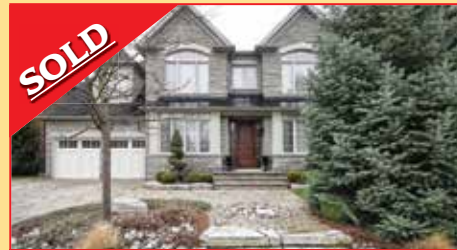
1043 Nellie Little Cres. Sold For Highest Sale Price On Street Since 2017. Call For A Free Market Evaluation.