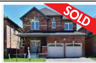
63 LEWIS AVENUE, BRADFORD