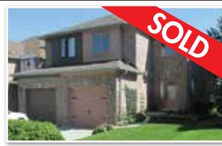
87 OCTOBER LANE, AURORA