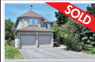
99 BROOKEVIEW DRIVE, AURORA