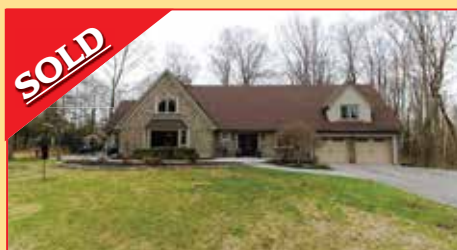
5 Spruce Tree Lane Listed & Sold By Rocco For $1,800,000 Call For A Free Market Evaluation.