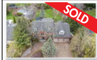
117 COON'S ROAD, RICHMOND HILL