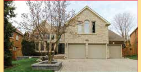
This One's Loaded! $1,988,000 Premium Lot, Demand Location! Thousands In Extras & Upgrades