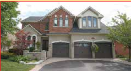
Muskoka Style Backyard $1,850,000 Totally Renovated Home From Top To Bottom, 3 Car Garage