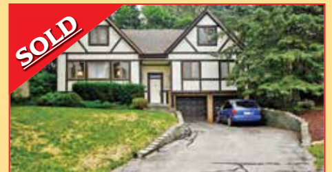
113 Aubrey Court Sold Within One Week For $1,050,000. Call For A Free Market Evaluation.

Call for a FREE Market Evaluation! 905-841-4787 You Get The "Right Results" With Rocco.