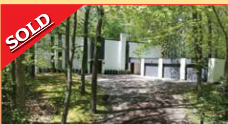
650 Stouffville Rd. Sold For 2.4 Million Within 2 Weeks! Call For A Free Market Evaluation.