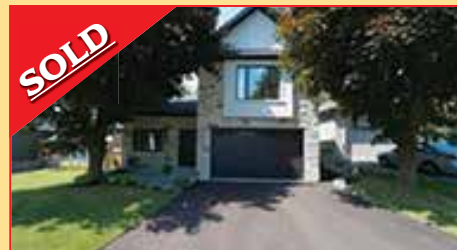
122 Roxborough Rd. Sold For $1,180,000. Call For A Free Market Evaluation.