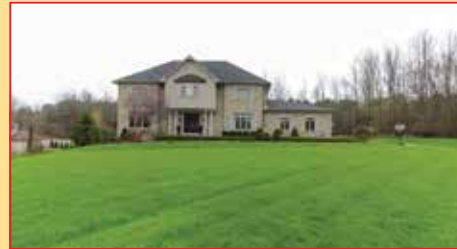
In Town Paradise! Over 5,000 Sq Ft Custom 2 Storey Home With Amazing Backyard Oasis! $2,200,000