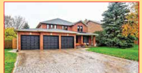
You'll Love The Backyard! $1,238,000 Inground Salt Water Pool. Renovated 2 Storey Home With Potential For In-Law Apartment.