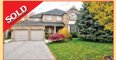
1057 Vice Regent Pl. Sold For Effective Price Of $1,302,500. Call Today For A Free Market Evaluation.