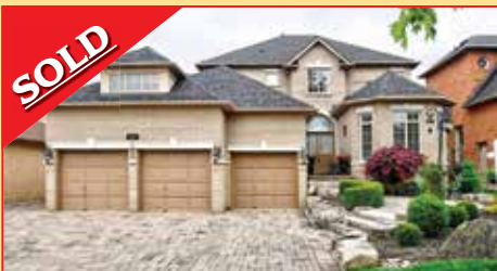
725 Quatra Cres. Sold For $1,360,000 Call For A Free Market Evaluation.