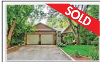
14 ALBERY CRESCENT, AURORA