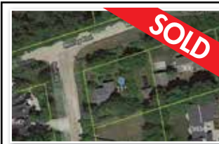
317 MURRAY BOULEVARD, INNISFIL