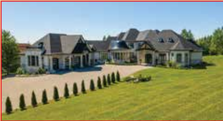
Modern Bungalow On 2 Acres In Southend Aurora, 7,500Sqft Plus Walkout Basement, 8 Car Garage $6,680,000

List with one of Canada's Top Producers, ranked # 72 in Canada out of approx. 21,000 RE/MAX Agents in 2017.